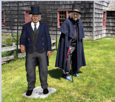
In May, the Historical Society premiered a new augmented reality program at Mulford Farm featuring an avatar of Hugh King. Available via the 1776AR mobile app, Hugh tells the story of the American Revolution in East Hampton.