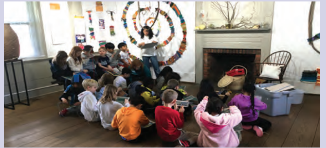
This past year, the Historical Society welcomed thousands of students to its sites. While visiting the Indigenous exhibition at Clinton Academy, second graders from John M. Marshall School learned weaving, beading, and how to make pigment.