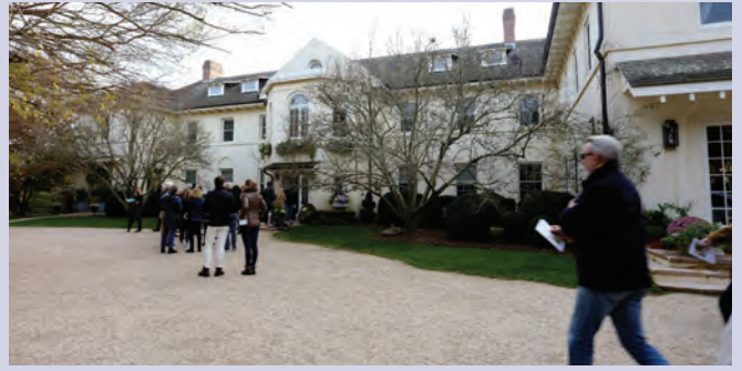
The 38th Annual East Hampton House & Garden Tour sold out in record time and featured five spectacular houses in East Hampton and the Devon Colony.