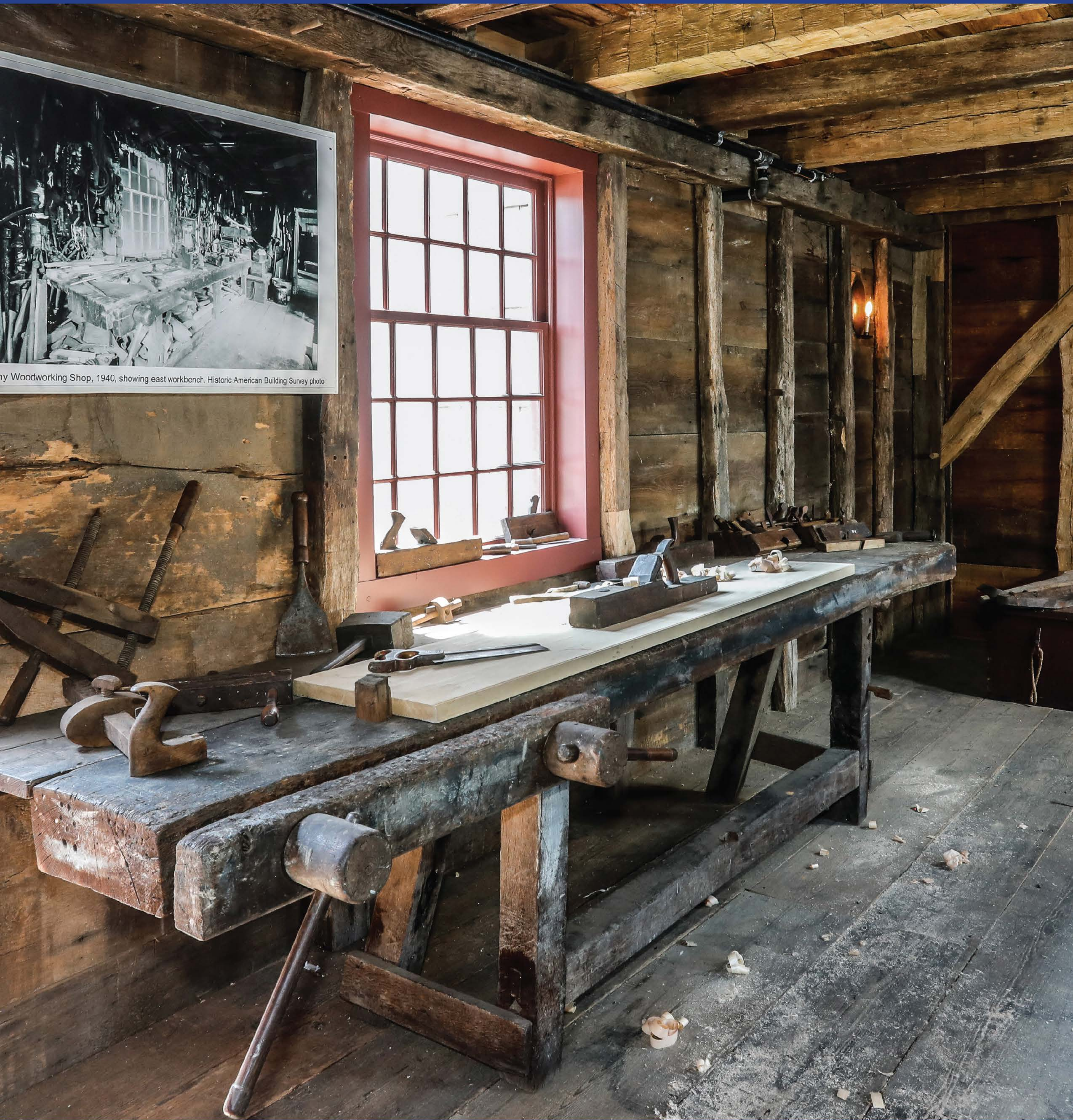
ny Woodworking Shop, 1940, showing east workbench. Historic American Building Survey photo