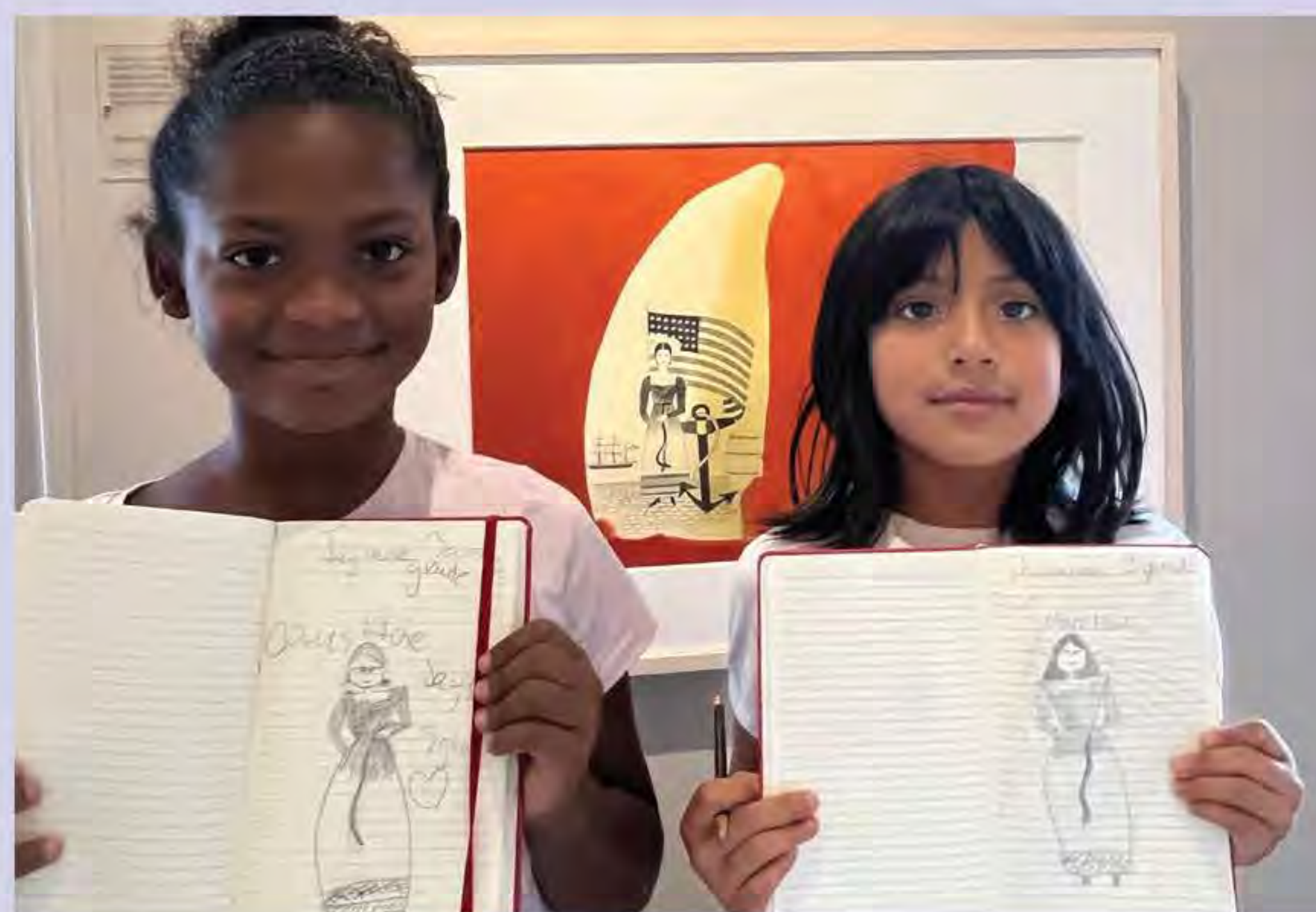
Third grade students from Amagansett School made drawings of scrimshaw at the Marine Museum.