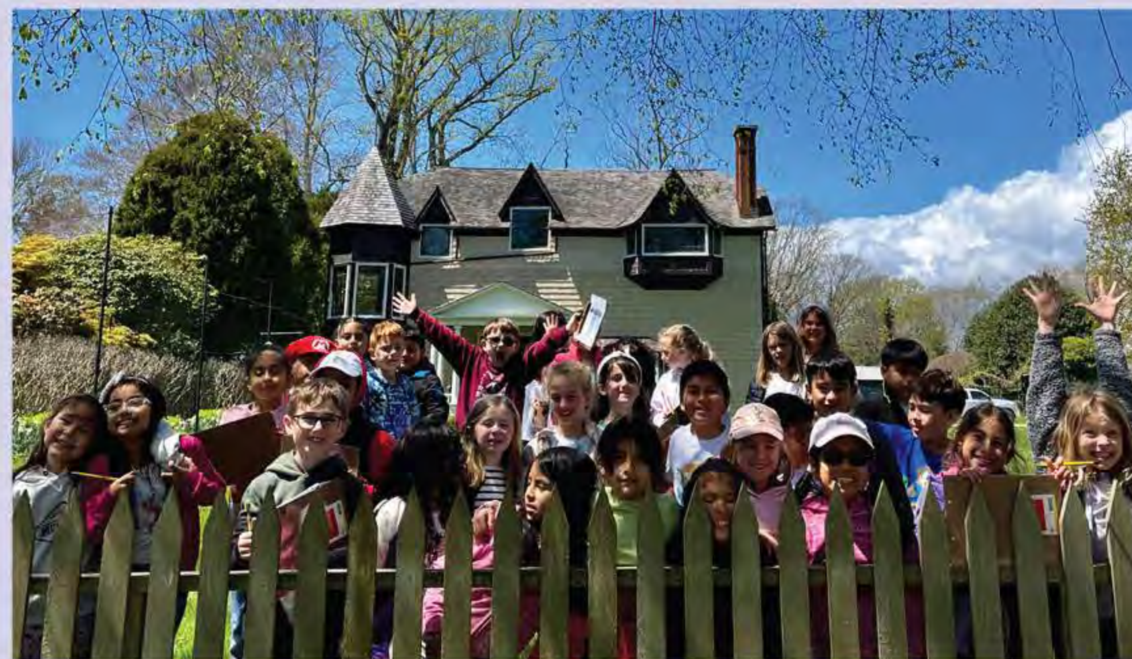
John M. Marshall Elementary School visiting the Thomas and Mary Nimmo Moran Home & Studio.