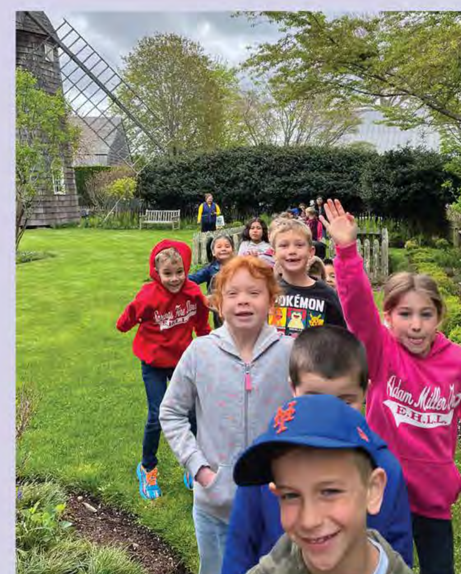
During a field trip to Mulford Farm, East Hampton first graders learned about cardinal direction and had the opportunity to visit Home Sweet Home.